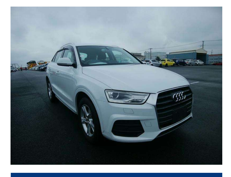
Purchase Price Includes GST, Registration & Licensing

Finance may be available on this vehicle. Ask one of our friendly staff for more information.